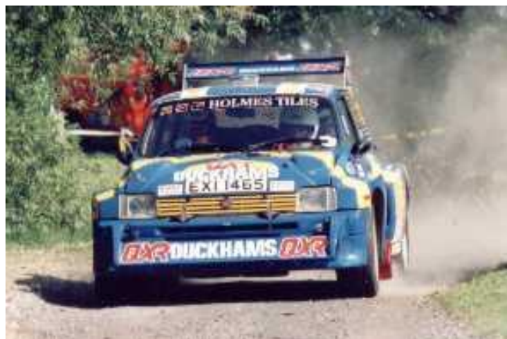
Left: Metro 6R4, chassis 064