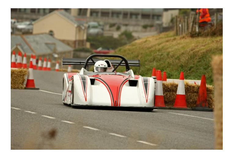
Stuart Lillington – FTD 2018

The second running – on an extended course – of the closed road hillclimb at Watergate Bay will also run on September 14<sup>th</sup> and 15<sup>th</sup>.