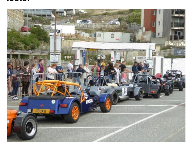
Cars waiting in the bottom paddock at Watergate Bay, 2018

Starting on the weekend of 31<sup>st</sup> August/1<sup>st</sup> September with the 'Cornwall Motorfest', there will be a full calendar of events throughout the month aimed at encouraging participation at all levels. These will include marshal training workshops, rally co-driver training, a classic tour and auto tests.