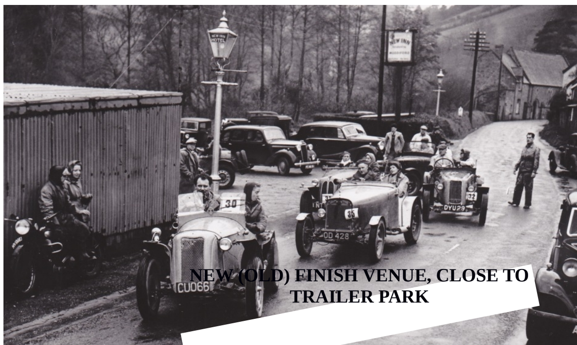
NEW (OLD) FINISH VENUE, CLOSE TO TRAILER PARK