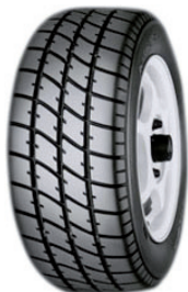
Yokohama A021R List 1B