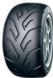
Yokohama A048R List 1B