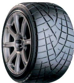
Toyo Proxes R1R List 1B