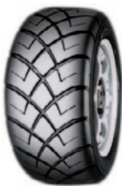
Yokohama A032R List 1B