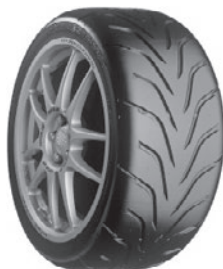
Toyo Proxes R888 List 1B

To ASWMC Championship Registrants On presentation of your registration card