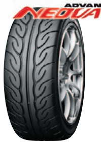
Yokohama AD08 List 1A