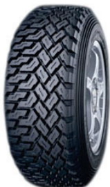
Yokohama A035R & A035E