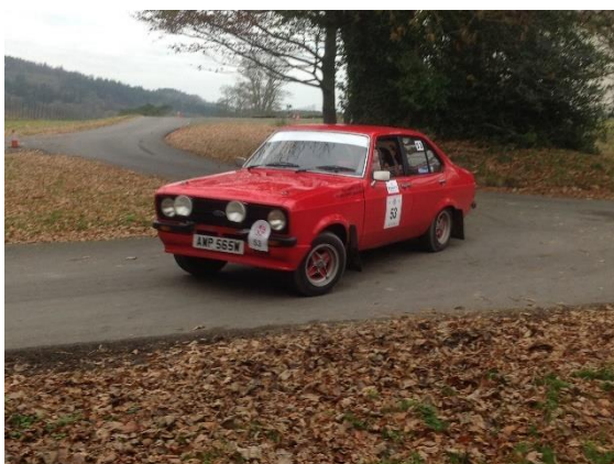
A Mk 2 Escort mid-test ...