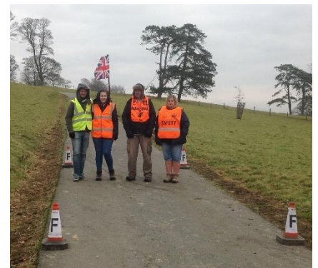
Plymouth MC marshals in their 'stop-box'

Fifty-five cars made it to Werrington, the sole absentee being a HERO 'Arrive and Drive' entrant. GPS monitoring logged them as still in Newquay when a Wadebridge control had closed and still 25 miles off-route somewhere when the fleet support vehicle that follows the field arrived at the test start!