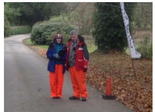
Waiting patiently at the finish ...