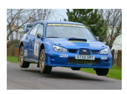
2015 Winner, Steve & Yvonne Furzeland (Subaru Impreza WRC)

The park is open to spectators over the rally weekend – details on www.crswrallies.co.uk