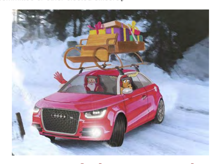
Merry Christmas and a Happy New Year!

(The Editor's comments in this column are personal and do not necessarily reflect the views of the Association, its executive committee or other elected officers.)