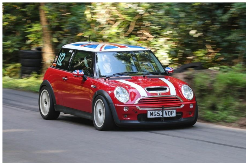
Picture: Richard Trevail