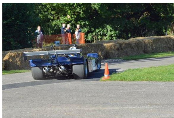
Track widening on the narrow section up to the left turn before the finish line.