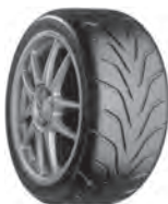
Toyo Proxes R888 List 1B