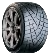
Toyo Proxes R1R List 1B

Sponsors of the ASWMC Hill Climb and Sprint Championships