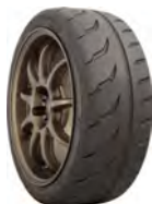
Toyo Proxes R888R List 1B