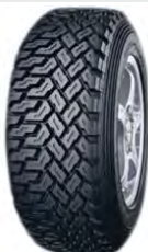
Yokohama A035R & A035E