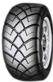
Yokohama A032R List 1B