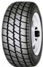
Yokohama A021R List 1B