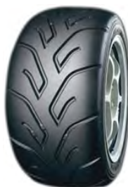
Yokohama A048R List 1B