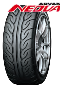
Yokohama AD08 List 1A