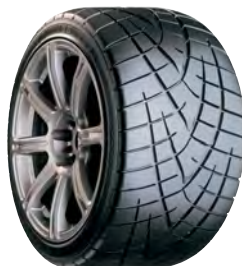
Toyo Proxes R1R List 1B