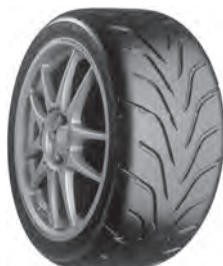
Toyo Proxes R888 List 1B

SPECIAL PRICES To ASWMC Championship Registrants On presentation of your registration card